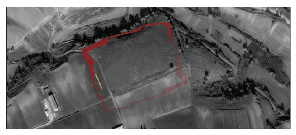
Fig. 3. Reconstruction of peripheral ditches.

Ephorate of Prehistoric and Classical Antiquities of the Hellenic Ministry of Culture and Tourism under the direction of Georgia Stratouli and the collaboration of an interdisciplinary team of researchers. Based on radiocarbon dating, the Neolithic settlement dates to the Middle Neolithic (c. 5700–5300) and the Late Neolithic I and II (c. 5300–4500, most probably later on, too), with the earliest use of the site dating to c. 5650 calBC. Two distinct phases of occupation are evident: AVGI I, dating mostly to the second half of the 6<sup>th</sup> millennium (Middle Neolithic and Late Neolithic I), and AVGI II, dating to the 5<sup>th</sup> millennium (Late Neolithic II).