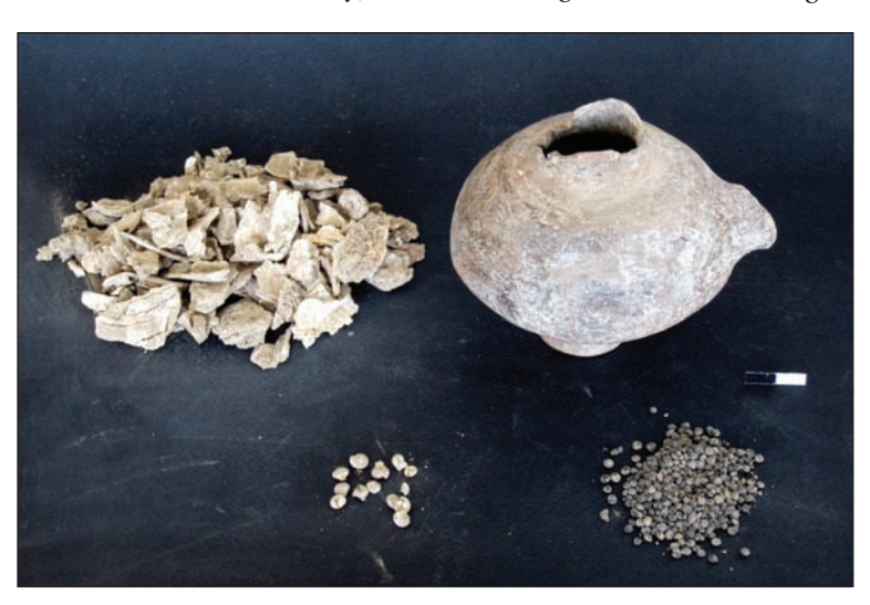
Fig. 14. Burial pot containing skeletal remains and carbonized seeds.

ties, which had an important role in the daily round of the Neolithic community. From another point of view, the seeds can be viewed as representing the agricultural cycle (Bradley 2005). In contrast with most things that have a finite life - including people, animals, houses, villages and objects - a seed is part of an unending cycle, since it produces more seeds if planted again. Putting together humans and seeds may be interpreted as an attempt to transcend the effects of life and death and embrace permanence (Williams 2003). Besides, the disposal of these tokens of memory in the domestic environment of a living community had a special meaning. Incorporation of the ancestors into the living world would reflect a strong desire by the community not only to the preceding generation, but also to the particular central area of the settlement. Although building remains from the early phase of AVGI II to which the burials are probably contemporary are scarce, there is enough evidence of a variety of everyday tasks occurring in the proximity to the burial area, indica-