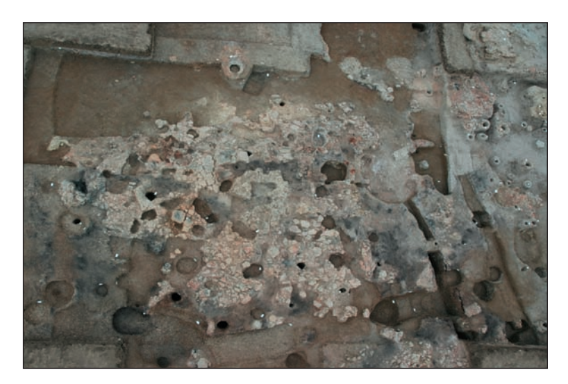
Fig. 5. Architectural remains dated to the second half of the 6<sup>th</sup> millennium (AVGI I).

modern ploughing, so both its original form and contents may have been affected. It is a matter of further research to explore whether the small pots were buried within a pit or placed in an open or an encircled area of the settlement, or whether the area was covered and marked by a tumulus or any other construction. The good preservation of both the pots and their covering sherds indicates that they were not exposed for a long period after their disposal, but again there are no indications in the excavated part to suggest the opening of a large burial pit in order to include the small group of urns. These issues are unresolved to some extent by the fact that the excavation in that particular area of the settlement is still in progress, and therefore the limits of the burial area remain under investigation.