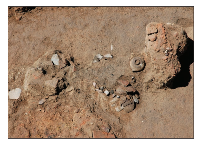
Fig. 10. A pair of burial pots: in one case, the pot is still covered with sherd fragments.

At Neolithic Avgi, the small quantity of bone found in pot burials limits the analysis with regard to information which can be provided from cremated bones. The majority of the cremated fragments recovered from the site exhibit patterns of calcination, coloring, fragmentation, fissures, transverse and longitudinal fracturing and warping to be consistent with burning as fresh bone with the flesh still attached, as opposed to burning dry bone, without flesh. With regard to burning temperature and duration, the evidence from calcined bones shows that pyre temperatures reached at least 700°C at the level of the body, while exposure to high temperatures was probably a lengthy procedure. High fragmentation may have been caused due to the continuous addition of fuel during the burning process and the consequent mixing of pyre debris with long sticks. The morphology, size and structure of the bone indicate that six out of ten burials belong to adults, and only one to an infant, but there were no features preser-