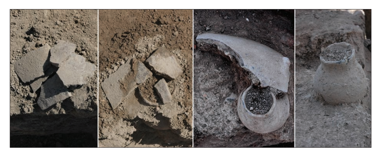
Fig. 9. The stages of excavating and 'revealing' a burial pot.

ary rituals, once their 'cultural biography', carrying a number of meanings through their use in different social and cultural contexts, was completed.