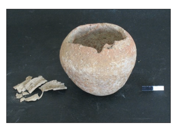
Fig. 13. Burial pot containing tiny amounts of skeletal remains.

ties, which had an important role in the daily round of the Neolithic community. From another point of view, the seeds can be viewed as representing the agricultural cycle (Bradley 2005). In contrast with most things that have a finite life - including people, animals, houses, villages and objects - a seed is part of an unending cycle, since it produces more seeds if planted again. Putting together humans and seeds may be interpreted as an attempt to transcend the effects of life and death and embrace permanence (Williams 2003). Besides, the disposal of these tokens of memory in the domestic environment of a living community had a special meaning. Incorporation of the ancestors into the living world would reflect a strong desire by the community not only to the preceding generation, but also to the particular central area of the settlement. Although building remains from the early phase of AVGI II to which the burials are probably contemporary are scarce, there is enough evidence of a variety of everyday tasks occurring in the proximity to the burial area, indica-