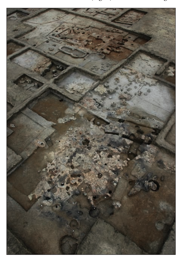
Fig. 4. Western part of the excavations.

The burial area at the Neolithic settlement at Avgi is located at the center of the site, covering a rather small area of about 3.0m<sup>2</sup> (Fig. 7). Based on stratigra-