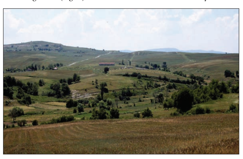
Fig. 2. The site at Neolithic Avgi.

The Neolithic site of Avgi<sup>1</sup> ( Stratouli 2004; 2005; in press ) is located in hilly terrain, rich in clay deposits, in the Kastoria region, NW Greece (Figs. 1 and 2). The site forms an 'extended' settlement (Fig. 3), a well-known type in the Balkan Neolithic and now widely recognized in the Neolithic of Northern Greece. The known size of the site is about 5ha of which some 2000m<sup>2</sup> were investigated during excavations (Fig. 4) carried out from 2002 to 2008 by the 17<sup>th</sup>