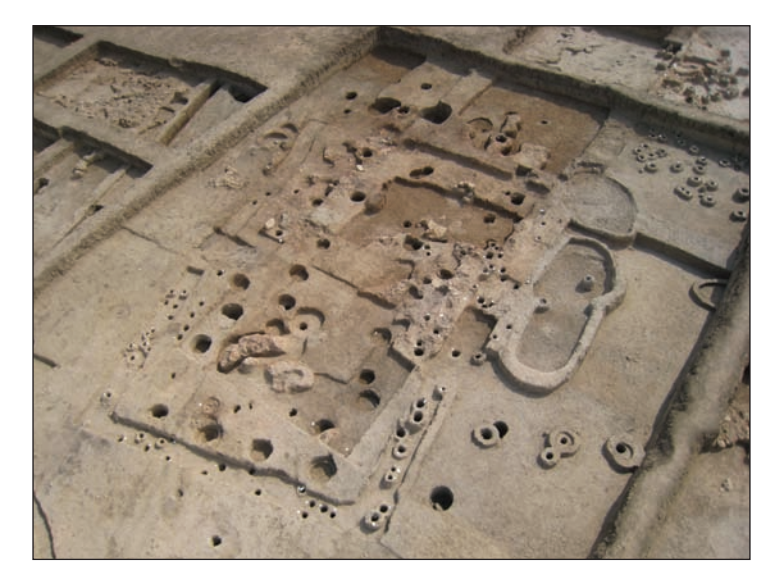
Fig. 6. Foundation ditches, post holes and pits dated to the 5<sup>th</sup> millennium (AVGI II).

The upper layers of the burial area were significantly disturbed by the later Neolithic occupation and