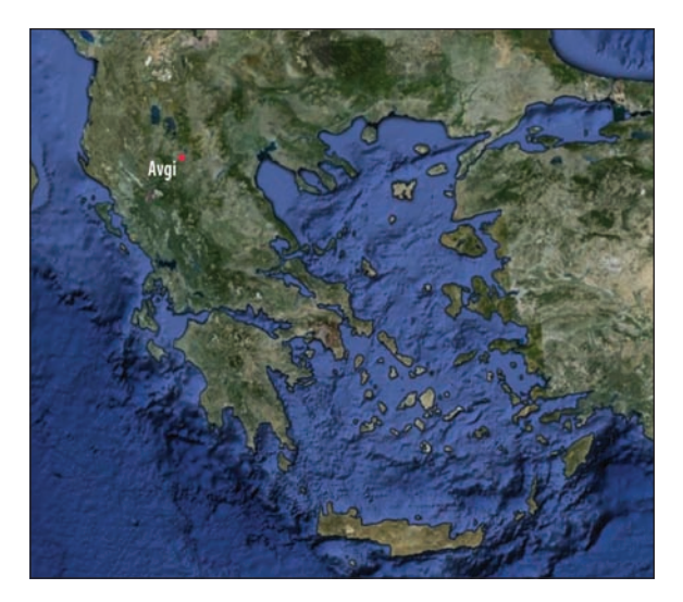
Fig. 1. Map indicating the location of the site.

Recent excavations at the Neolithic settlement of Avgi, in Kastoria ( Stra touli in press ) (Fig. 1) shed light on aspects of mortuary treatment in the Neolithic of Northern Greece. A