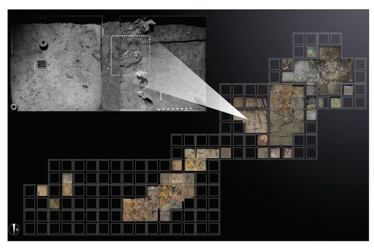
Fig. 7. Location of the burial area within the settlement.

a small 'black-topped' spherical necked jar, possibly missing a handle, is present. The surface treatment of the burial pots also varies: four pots show smoothed exterior surfaces, while six are burnished. Moreover, two distinct techniques can be detected in the manufacturing process of the burial pots: most were manufactured with the 'coiling' technique, in which coils of clay are used to build up the pot ( She pard 1968.75 ). The remainder and the smaller pots were crafted using the 'pinching' technique, in which