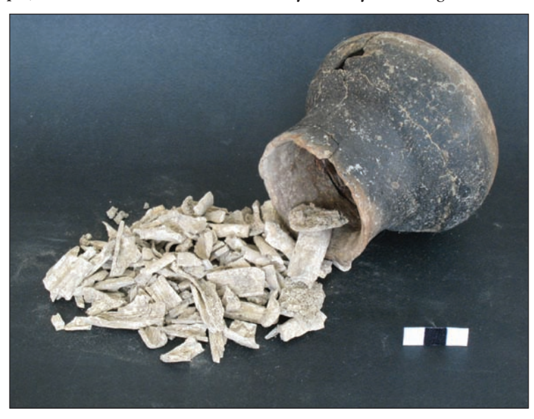
Fig. 8. Burial pot with associated skeletal remains.

Also, some pots show wear marks on the exterior surface of their base. This feature would suggest that these particular pots prior to their deposition in the burial ground were used in some other activity in the context of Neolithic daily life, and therefore the 'circle of their life' ended along with the life of an individual. In sharp contrast, there are pots that exhibit more 'hasty' manufacture characteristics (Fig. 13), in terms of shaping, forming and even firing, indicating that they were made for use only as funerary urns.