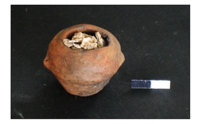
Fig. 12. A miniature hole-mouth jar with associated skeletal remains.

is no doubt that these individuals were buried in this specific area of the settlement in an exceptional way, while most members of the community were probably treated differently. What were the criteria which determined this selection? Were the individuals buried in that area selected randomly, or were they related by some close ties, which were distinct to the Neolithic community, but totally inaccessible to us? Ethnographic studies would suggest that such ties could be related to lineage, social identity and age, or even to a violent and abrupt cause of death (Parker Pearson 1999). Whether or not other members of the Neolithic community of Avgi received a similar or different type of manipulation after their death remains unknown, since there is no other related evidence in the excavated area. The occurrence of another burial area within the settlement or in close proximity to it may be possible. In any case, it is remarkable that a group of people was disposed at a distinct area within the domestic environment, which was visible and accessible to the members of the living community only. Moreover, the complex funerary ritual, which was probably a lengthy and